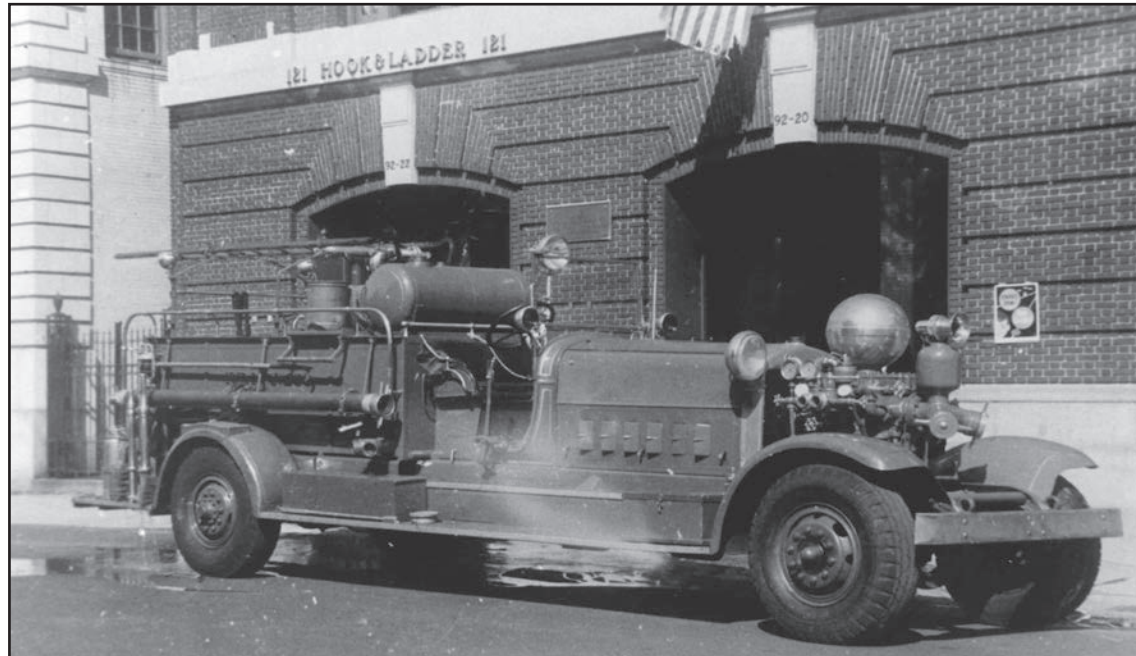
Engine Company's 266 apparatus, a 1934 Ahrens Fox Pumper, is pictured here from years ago in front of their quarters at 92-20 Rockaway Beach Blvd. in the Hammels' section of Rockaway, Queens. Their firehouse was opened in 1922 and was once known as the "Rockaway Big House." Over the years, Engine 267, Ladder 121 and the Chief of the 47th Battalion was quartered in their firehouse. Today, only Engine 266 remains.

This calendar, workchart, and information directory is published as a membership service by the UFA. The UFA is the labor union and official bargaining agent representing all Firefighters, Fire Marshals & Marine Wipers, Pilots and Engineers who loyally serve the people of New York City each & every day.